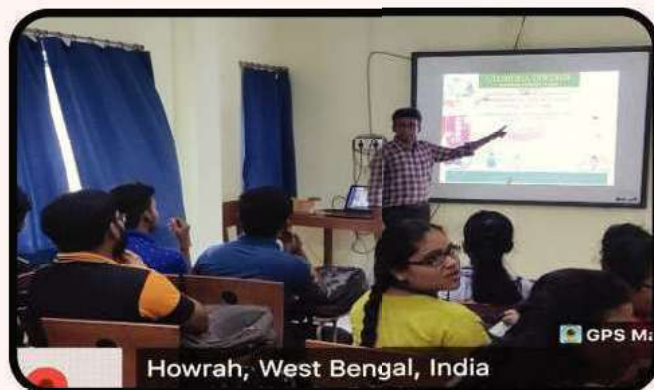
Howrah, West Bengal, India