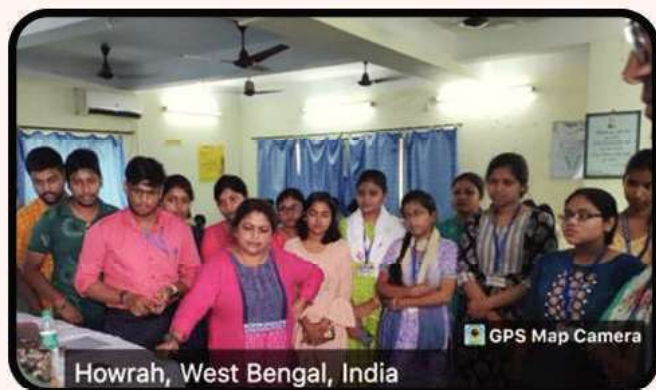
Howrah, West Bengal, India